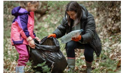
Join our Litter Squad on 15 March