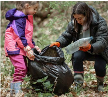
Join our Litter Squad on 19 October