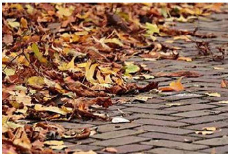
Beware of wet leaves causing slippery conditions