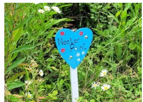
Did you know the Village Orchard has a wildflower garden and a bug hotel?