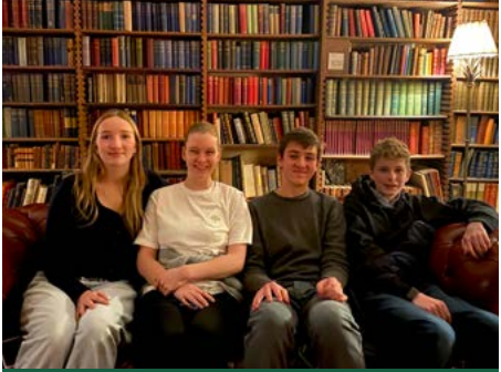
Youth Council in "Button" Library at West Horsley Place Parish Volunteers Event