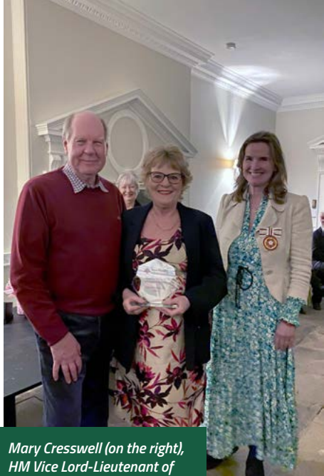
Surrey with Winners