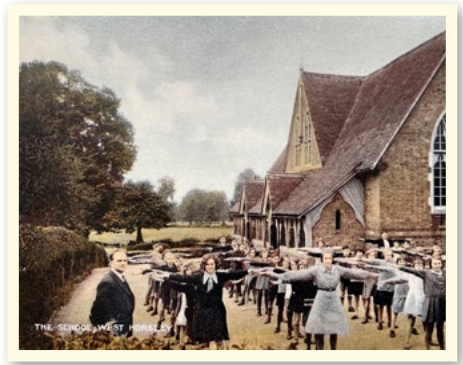
The old School House now apartments