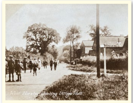
The West Horsley Village Hall